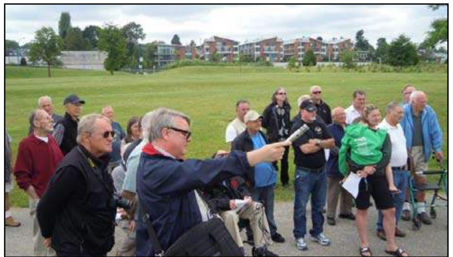
On June 18th, a small group of retired and active members gathered at New Brighton Park to commemorate the events of June 18, 1935. If we fail to remember the sacrifice of our past generations of longshoremen we will not be able to fight the battles of the future.