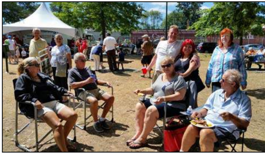
pensioners and friends enjoy the July 16, 2015 picnic