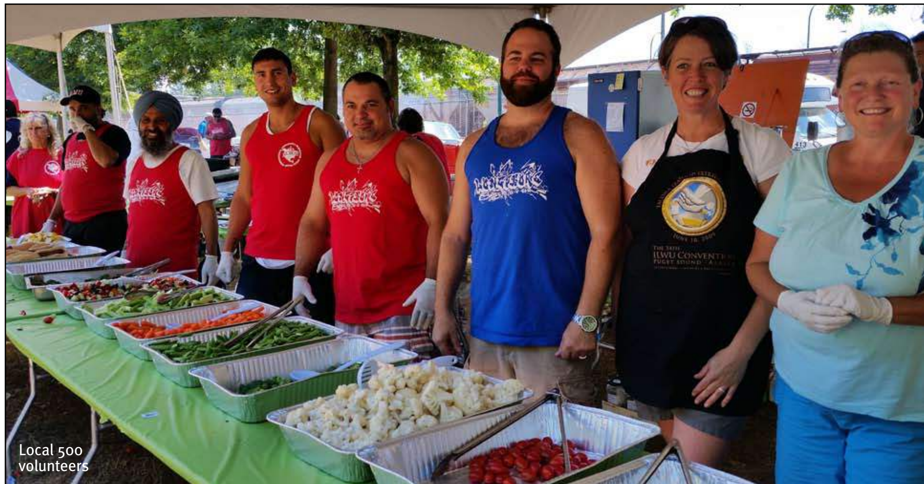
Local 500 volunteers